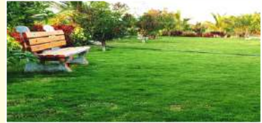
Parks & Gardens