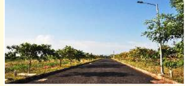
Wide & Spacious Black Top Roads