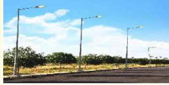
Electrical Lines With Designer Street Lighting