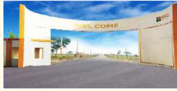
Exclusive Guarded Community