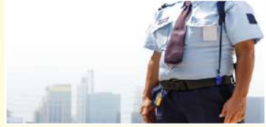
24 x 7 Security