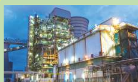
Industrial zone : so many industries established in Shadnagar and Kothur surroundings.