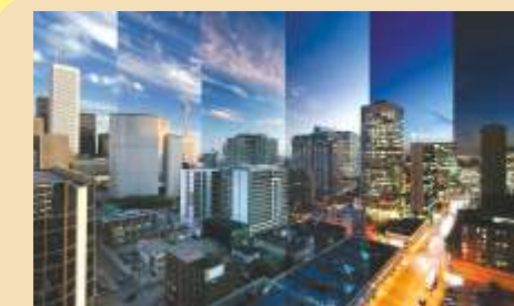
30 mins to Metropolitan City.

Rajiv Gandhi Nanotech Park, Hi-tech city, Gachibowli, and Financial District are just a 55mnts drive from FORTUNE SMART CITY.