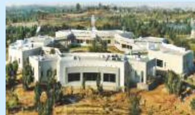
Very near to National Remote Sensing Center (NRSC) and ISRO center.