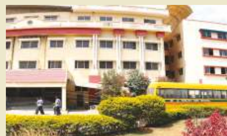
Educational wise good schools & colleges.

Outer Ring Road 30 minutes drive. Railway Cargo Freight Terminal at Timmapur 15 minutes drive.