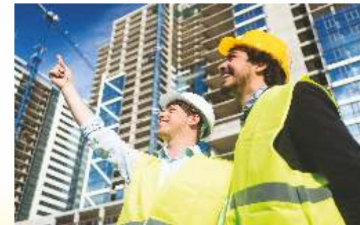
On Going Projects