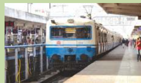
MMTS Connectivity to Shadnagar