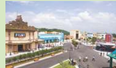
Shadnagar is the up coming Film industries.*Closed to RRR(Regional Ring Road)