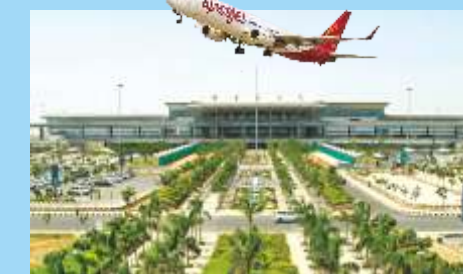
30 mins to International Airport.