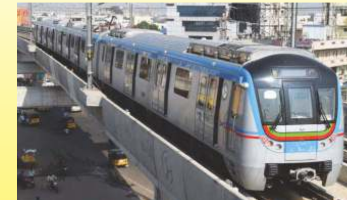
METRO Connectivity to Shamshabad