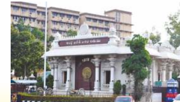
Proposed Shamshabad Secretariat