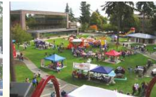
Good Social Infra Structure like schools, colleges, hospitals, transportation and recreation parks.