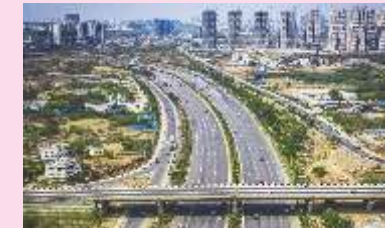
Six lane National Highway No:- 44 (Largest in the country connecting Kashmir to Kanya kumari).