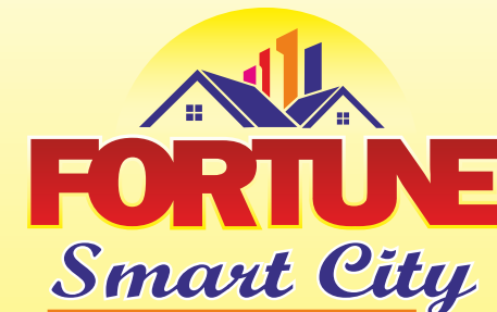
Shad Nagar Premium Residential Plots