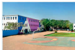
Johnson Grammar School