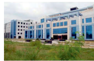
AIIMS Bibinagar Hospital