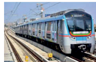
LB Nagar Metro