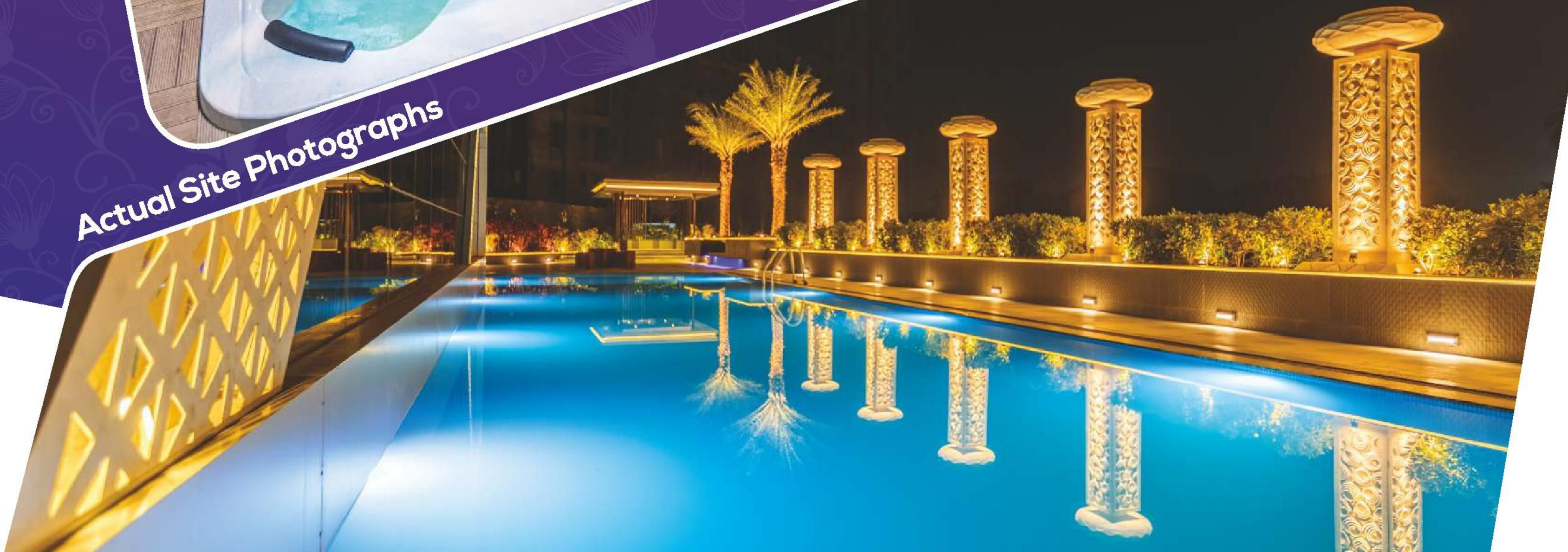
Actual Site Photographs