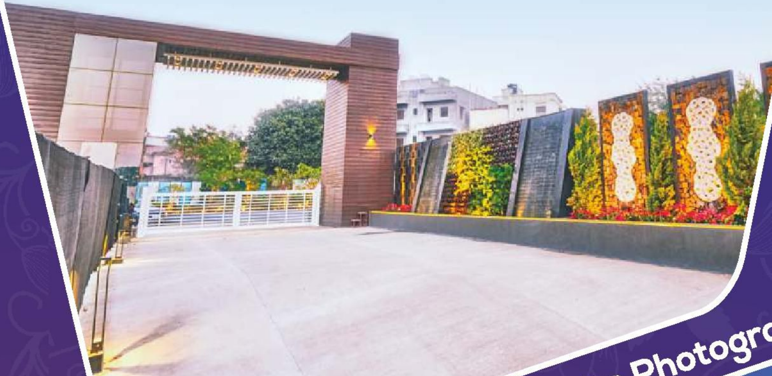
Actual Site Photographs