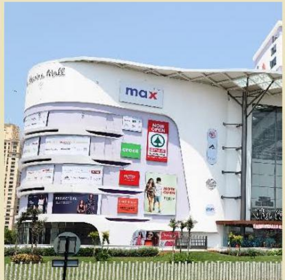
Marina Mall 10 kms