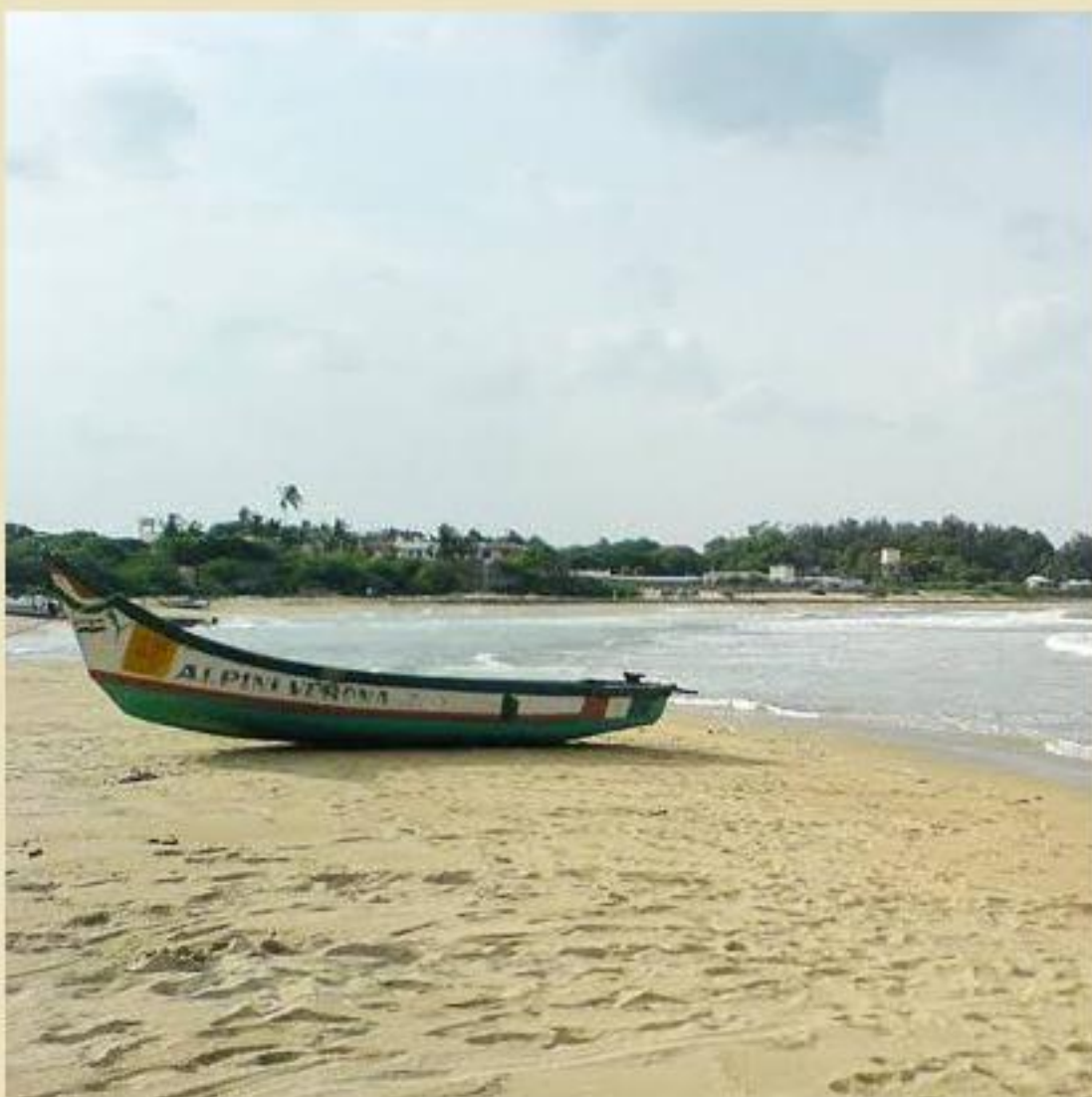
Kovalam Beach 10 kms