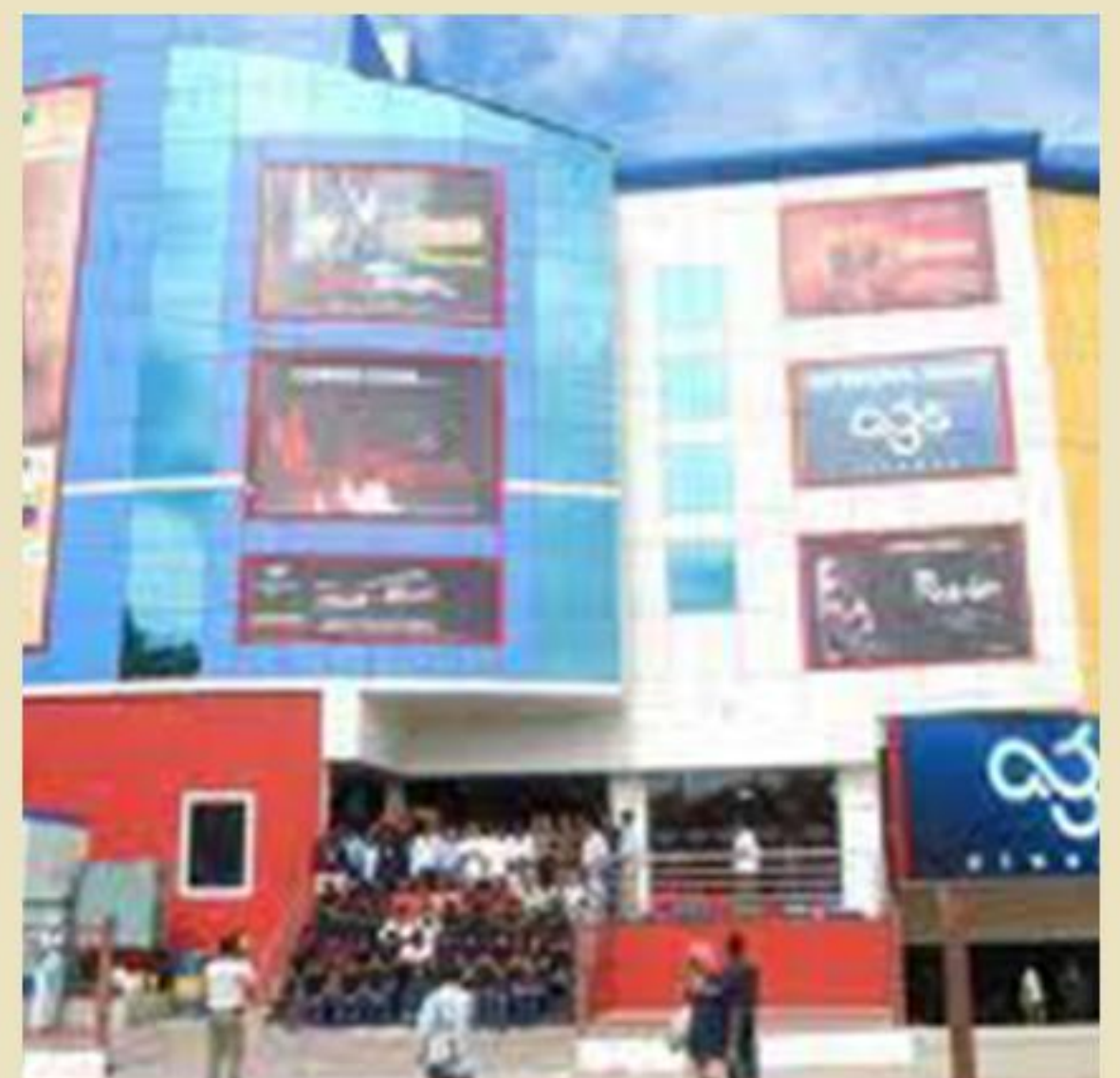
AGS Cinemas 10 kms