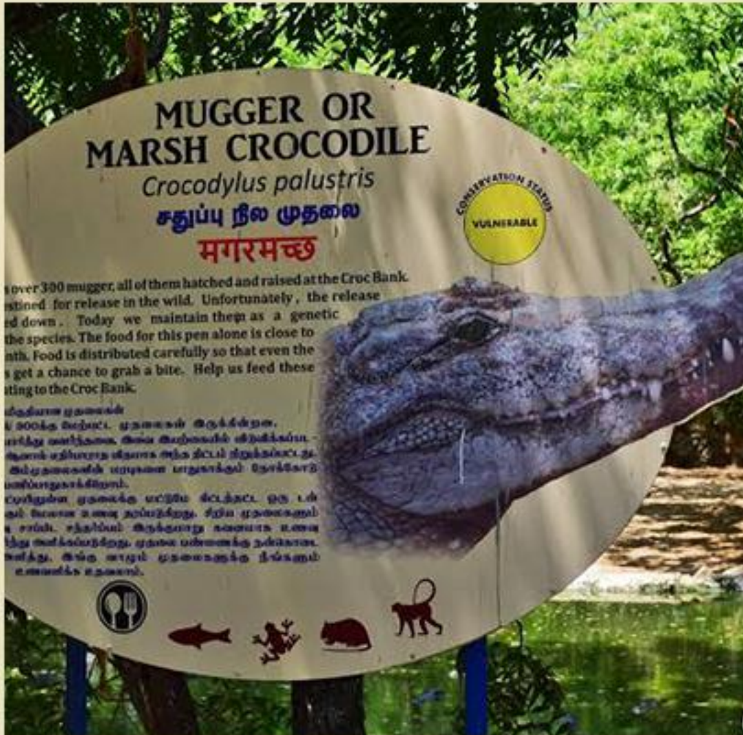
Madras Crocodile Bank - 10 kms